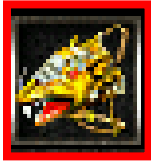
Image of Devil Rat King's Mask